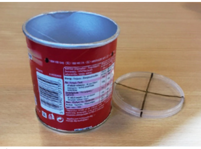
Figure 5 - Pringles tube.

representing your parachutists). The parachutes must be dropped from the same height each time (otherwise there would be more than one variable). Therefore, it may be best for an adult to stand and reach up as high as they can then drop each parachute as this keeps the test as fair as possible. The pupils