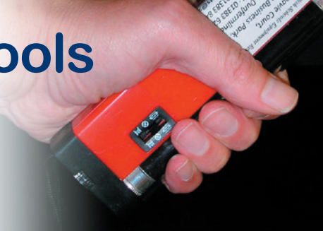
Figure 1 - "Handheld" UV lamp.