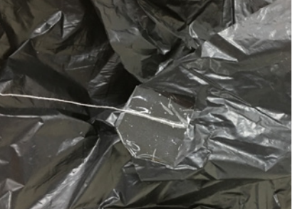
Figure 4b - Attaching the thread to the parachute.

representing your parachutists). The parachutes must be dropped from the same height each time (otherwise there would be more than one variable). Therefore, it may be best for an adult to stand and reach up as high as they can then drop each parachute as this keeps the test as fair as possible. The pupils