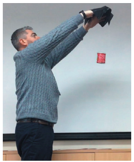
Figure 6 - The teacher then holds the parachute as high as possible and drops.

should record the time taken from the adult releasing the parachute to the Pringles tin hitting the ground (Figure 6).