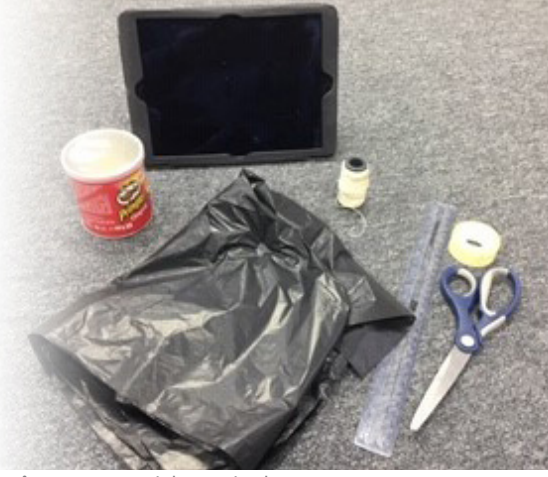
Figure 1 - Materials required.

The following link provides a great visual for explaining and demonstrating to the children what happens when a parachute cord is pulled [6].