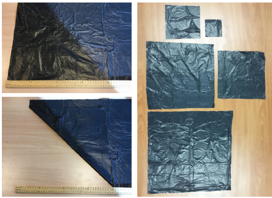
Figure 3 - Measure and cut out all the squares to the desired size of parachute.

Using your ruler measure along the plastic sheet to the desired size of parachute (Figure 3) and cut out all the squares to the sizes detailed in the Table 1 below.