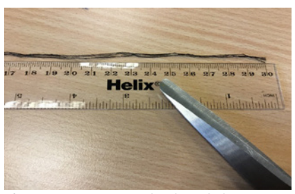
Figure 4a - Measuring the thread photo.

Remember the left-over Pringles? You now need to place 1 of these Pringles in the tin and put the lids on (remember the Pringles are