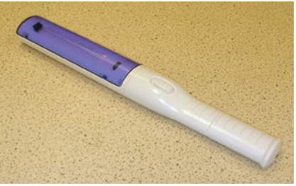
Figure 2 - Sterilising wand.

The spreading germs experiment can be done successfully with glitter gel in which case a UV lamp is not required to show its spread.