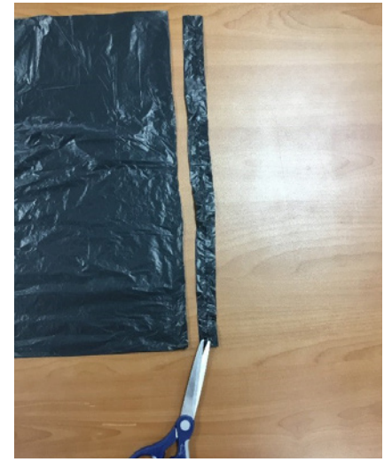
Figure 2 - Cut the bottom sealed section of the black bin bag.

Prior to starting the investigation, the activity found at the following links gives a quick and simple introduction to air resistance that will provide an understanding of the effect surface area has on speed of descent [4,5]. After carrying out the activity, children should be able to make a more informed prediction as to which parachute, they think will work best and give reasons for their decisions.