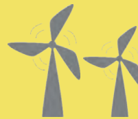
Energy Production/ Renewable energy