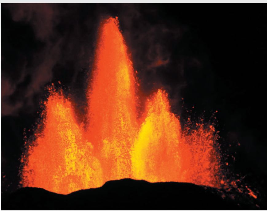
Lava fountains of the fissure eruption in Holuhran on Iceland.

This resource has a five-star review on TES Resources - "This is totally amazing!! A brilliantly inspiring resource."