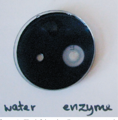
Figure 1 - The left hand well acts as a control by using distilled water instead of enzyme solution.

Diastase solution in a variety of pH buffers is used to investigate the effect of pH on the activity of diastase.