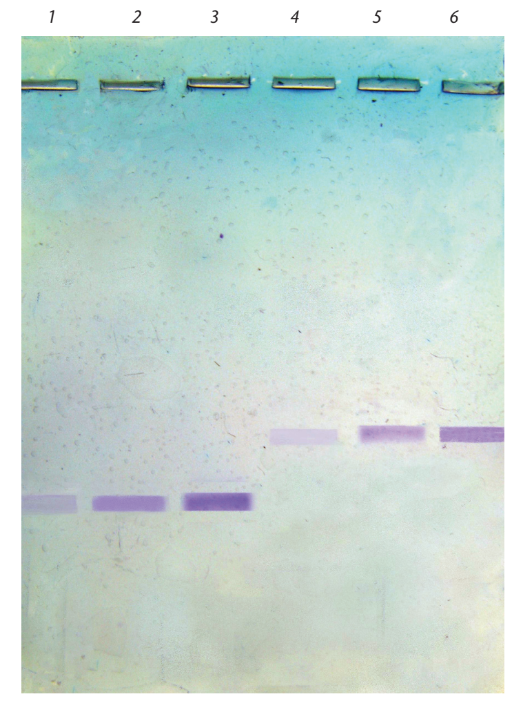
Figure 2 – Bands of cpDNA, stained with Azure A, obtained following PCR of chloroplast DNA from spinach (lanes 1-3) and red chard (lanes 4-6).