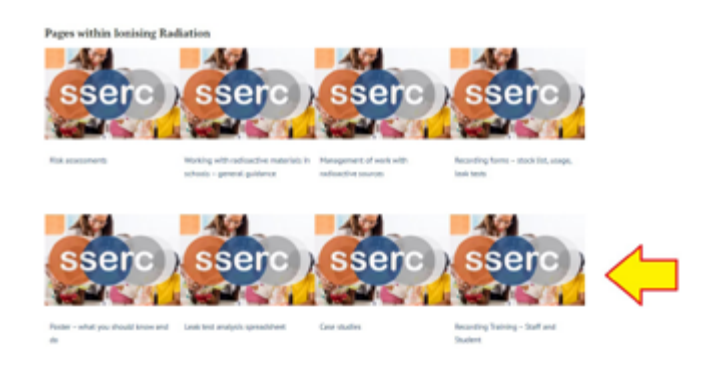
Figure 4: Where to look on our Ionising Radiation web page

The requirement to provide and record training applies not only to members of staff but also to learners, in the very restricted cases where learners can work directly with radioactive sources. We have produced a checklist (Figure 5) to work through when considering having a learner use radioactive sources. All the criteria on this checklist must be met before the learner use can commence. In order for a learner to work with radioactive sources they must be aged 16 years or over and all those in the same room as the learner working with the radioactive sources must be aged 16 years or over. The learner must also be supervised, they must have received appropriate training and a separate risk assessment specific to this needs to be carried out. Again, an editable version of this checklist can be downloaded from the ionising radiation pages of our website1.