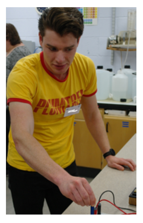
Figure 2: A delegate getting practical experience of working with sources on a recent SSERC training course.