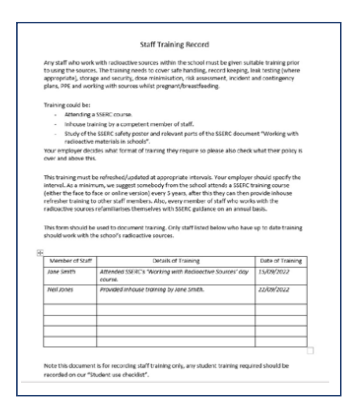
Figure 3: Staff training record template

The requirement to provide and record training applies not only to members of staff but also to learners, in the very restricted cases where learners can work directly with radioactive sources. We have produced a checklist (Figure 5) to work through when considering having a learner use radioactive sources. All the criteria on this checklist must be met before the learner use can commence. In order for a learner to work with radioactive sources they must be aged 16 years or over and all those in the same room as the learner working with the radioactive sources must be aged 16 years or over. The learner must also be supervised, they must have received appropriate training and a separate risk assessment specific to this needs to be carried out. Again, an editable version of this checklist can be downloaded from the ionising radiation pages of our website1.