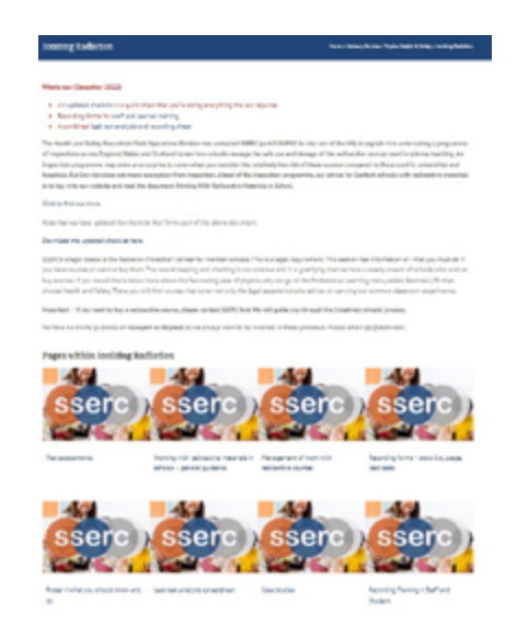
Figure 1: Ionising Radiation web page

Both initial and refresher training needs to be documented. It may be that your employer already has a system in place for recording employee training. If this is the case, ensure it is kept updated (including inhouse training) and store a copy along with your other records for your radioactive sources. Otherwise, we have produced a very simple template (Figure 3) you can use to create your own record documenting staff training. An editable version of this can be downloaded from the ionising radiation pages (Figure 4) of our website<sup>1</sup>. Only staff who have recorded, up to date training should work with a school's radioactive sources.