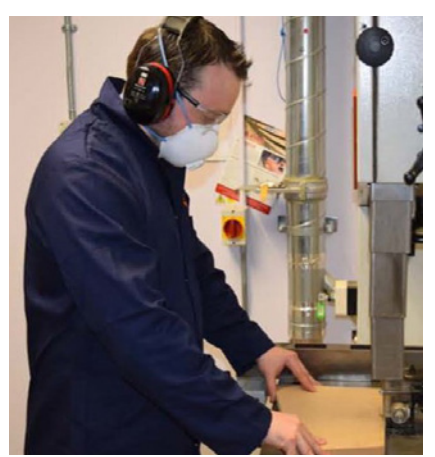
Safe use of fixed workshop machinery.