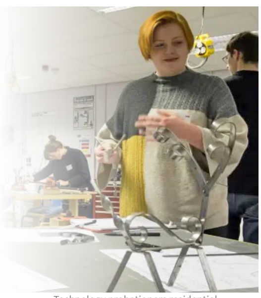
Technology probationers residential.