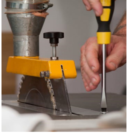
Maintenance of fixed workshop machinery and tools.