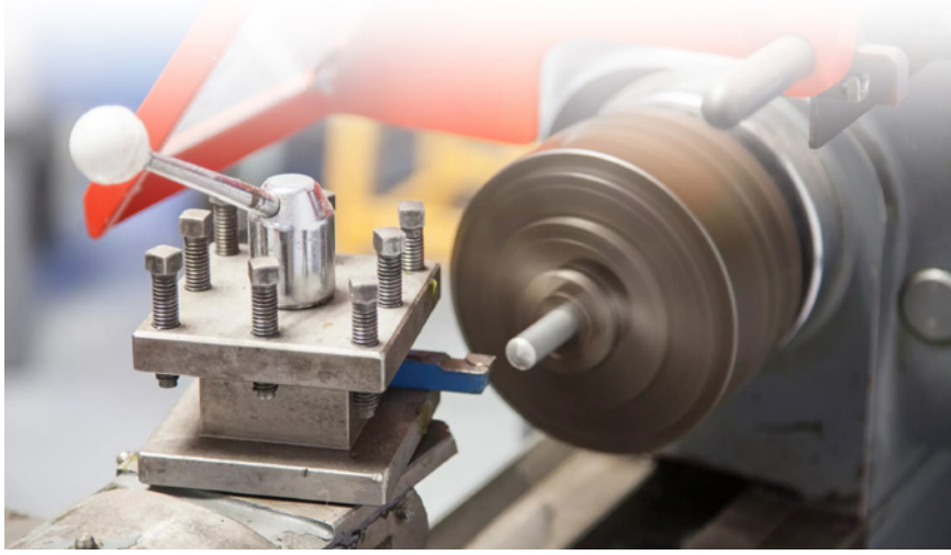
Centre lathe turning