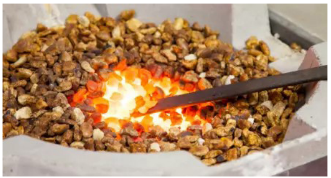
Hot & cold metal forming.

No prior experience of welding is required, and each participant will spend 2 full days in our workshop using the welding equipment to complete a range of basic welding tasks. Using various welding