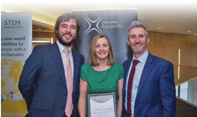
Figure 4 - Bucksburn and Dyce learning communities - joint winner of Enthuse Partnership of the Year for Scotland back in 2022.

Staff and learners in these five secondary schools worked with Jacobs, going on a journey of enhanced career-based learning, finding out the many STEM-linked opportunities and pathways that exist beyond school. As the learning took place, young people in these schools were challenged to design a solution for a new spaceport, wind farm or festival in Scotland; bringing in all aspects of STEM that would be required to successfully create, manage and complete the project. As with many of our partners, STE(A)M Ambassadors of Jacobs played a vital role in supporting, mentoring, and inspiring the school teams. This partnership was the joint winner of Enthuse Partnership of the Year for Scotland back in 2022 (see Figure 5). >>