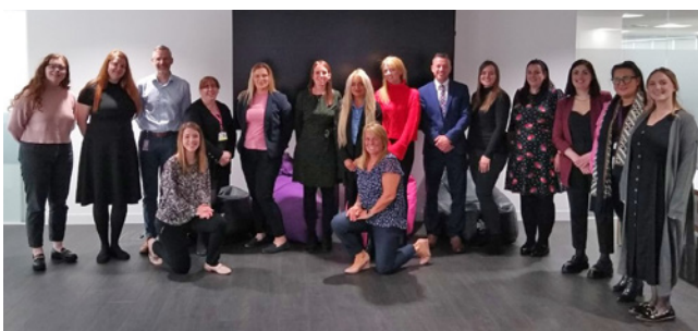
Figure 2 - The Teacher Launch at Leidos HQ.