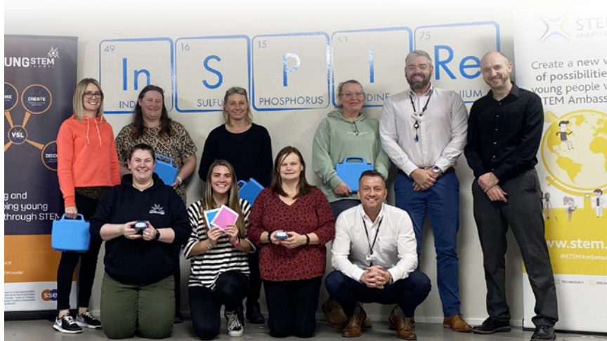
Figure 6 - Professional learning event at Dundee Science Centre with SSERC staff and partnership school leads.

This two-year partnership is focussing on digital technology in year one within the primary school setting and launched in the autumn of 2022. Two schools from Dundee City Council along with four schools in Angus, are working with SSERC to build resources and skills to bring robotics and technology into the classroom, allowing young people to go on and lead learning in this area. Dundee Science Centre is also supporting our partnership (Figure 6).