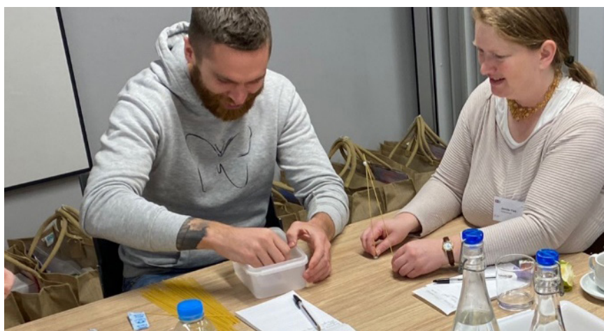
Figure 7 - Professional learning event at Aberdeen Science Centre with SSERC staff and partnership school leads.