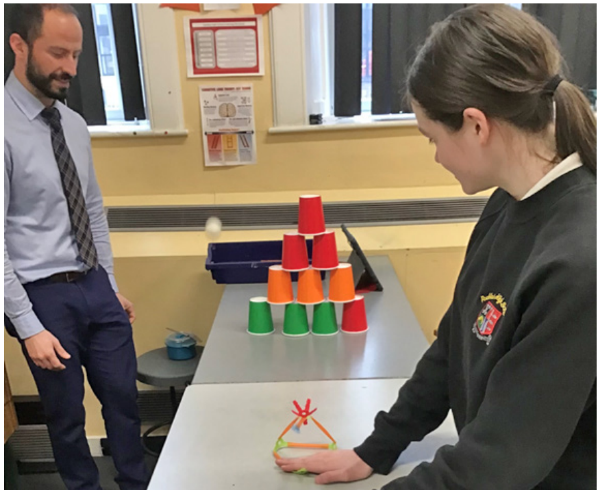
Figure 10 - Peebles High School YSLs bought Strawbees building kits with their grant and ran experiments making catapults and changing different variables to see the effects on launches.

Get started by registering as an educator at www.stem.org.uk/stem-ambassadors