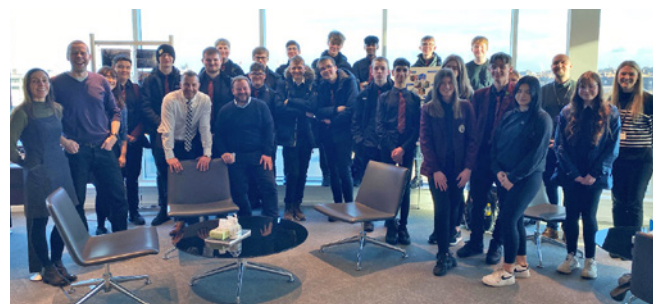
Figure 3 - Neptune Energy Challenge launch event.