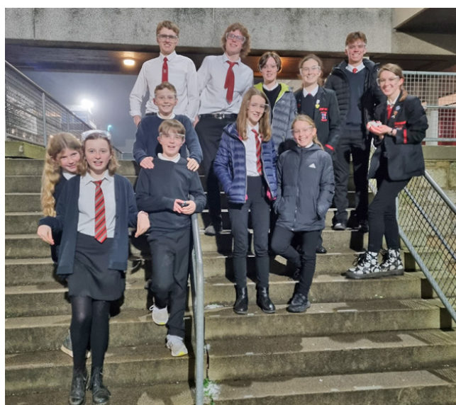
Figure 9 - Senior pupils at Balwearie High School in Kirkcaldy led pop rocket and make a Mars Rover activities with their STEM club.