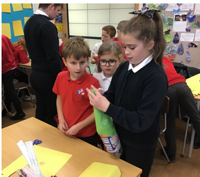
Figure 8 - YSLs at Ross High School in Tranent led bottle rocket and mentos and coke activities with feeder primaries.