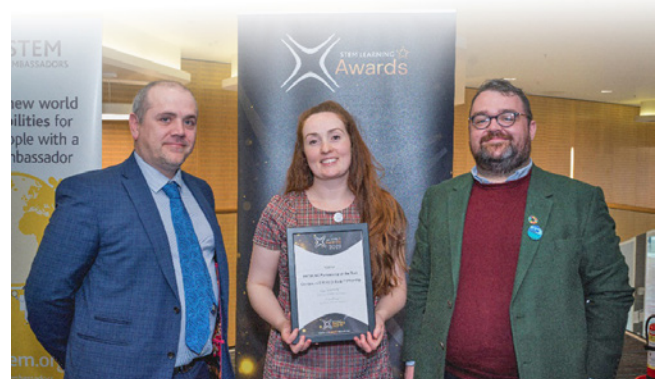
Figure 5 - Joint winner of Enthuse Partnership of the Year for Scotland back in 2022.