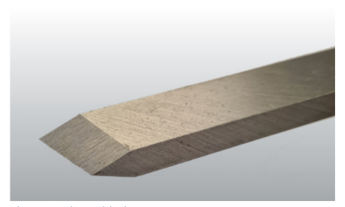
Figure 6 - Skew Chisel.

Gouges of the standard pattern are made in sizes ranging from 6 mm to 25 mm. Gouges are, in the main, used for roughing work, although very fine work can be carried out with the gouge when used correctly. For turning between centres roughly to size, a 25 mm gouge with a cutting edge of 45 degrees ground square across is recommended (see Figure 4).