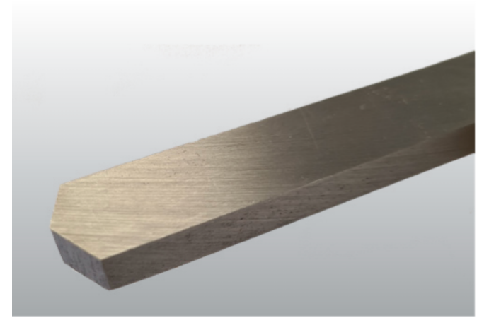
Figure 9 - Diamond point scraper.

For bowl turning, the gouge must be shaped like the end of a finger, i.e. the corners ground well back to an angle of 50-55 degrees. Like the bowl gouge (see Figure 5), the spindle gouge is shaped in the same way though the grinding angles differ – they should be ground to 35 degrees.