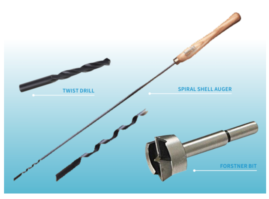
Figure 10 - Selection of boring tools.

In part 2, we will look at attachments for the lathe such as centres, face plates and chucks, as well as techniques how to use some of the common tools.