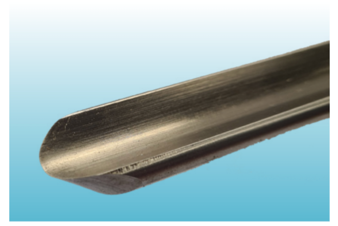
Figure 5 - Bowl gouge.

turned. ie. stock must not foul the tool rest.