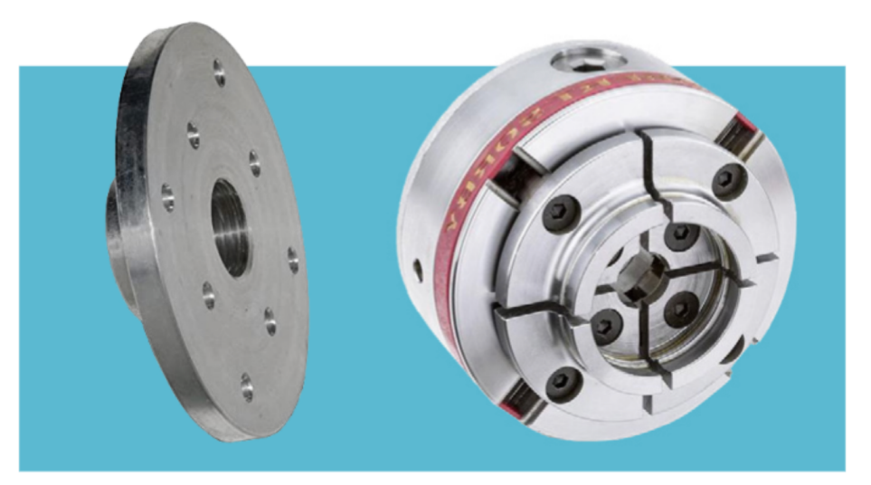
Figure 2 - Typical face plate and lathe chuck.

Safety, as with all activities undertaken in the workshop is