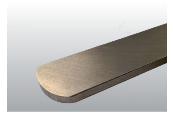
Figure 8 - Round nose scraper.