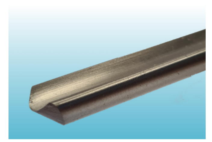
Figure 4 - Roughing gouge.