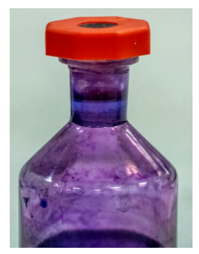
Figure 4: A stained glass bottle

It makes life a lot easier if you wash glassware as quickly as possible after use. If, as is more likely, a proper clean is not possible immediately, put it to soak in water. If this is not done, it could be impossible to remove the residue.