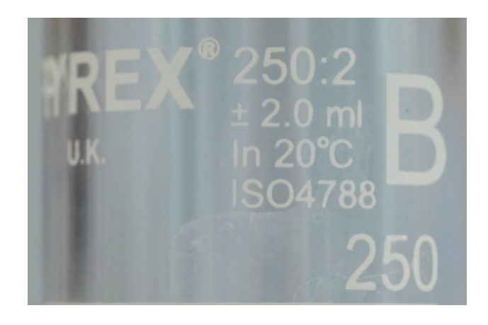
Figure 1: markings on a measuring cylinder

The standards referred to above only apply to the chemical composition of the glassware, not to its manufacture. Laboratory glassware comes in two grades: Class A and Class B – defined by various International Standards. Class A is manufactured to a greater accuracy in items such as pipettes and measuring cylinders but Class B is quite good enough for all school/college work.