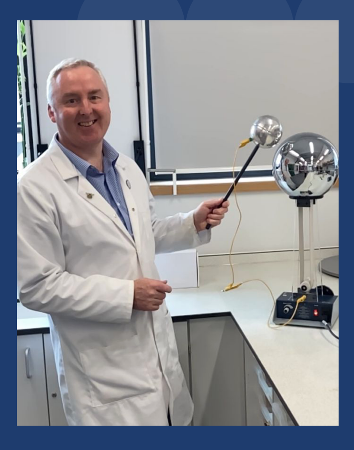
"Using the Van de Graff generator is also another favourite, for your hair standing up and electric shocks. It is always a winner."

Would you be interested in becoming a STEM Ambassador and sharing your story? Find out more here .