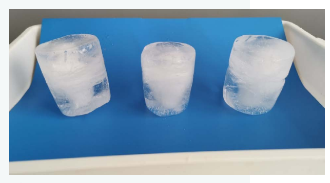
After one hour

Now pour the water from each bag into the measuring jug, you may wish to make a mark on the jug for each one, so it is easier to compare the results.