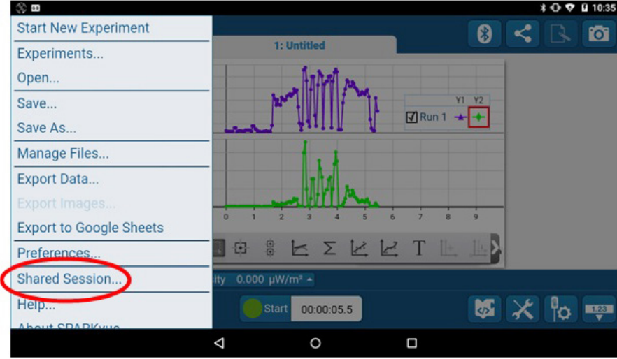
Figure 1 - Tap Shared Session.

This will give you two options: to Manually connect to an opened session, or to Start a Shared Session. The option you select will depend on whether you are the teacher, or a learner user.