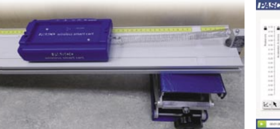
Figure 3 - Smart Cart set up to investigate simple harmonic motion.