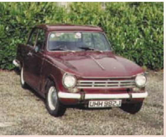
Figure 1 - Triumph Herald.

Modern cars may have a kilometre of wiring and more computer memory dedicated to stopping a CD from jumping than was used in an Apollo space capsule. Whilst car technology developed radically over the last three decades, the humble dynamics cart resolutely stuck to a formula of "box with three or four wheels and maybe a spring-loaded plunger". Recently, things have begun to change. Welcome to the Tesla Model-X of physics trolleys, the Pasco Smart Cart (Figure 2).