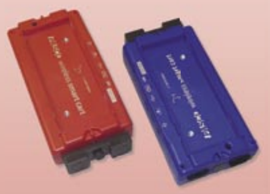
Figure 2 - A brace of Pasco Smart Carts.

Crumple zone experiments were also tried. These require a fast data capture rate - 100 readings per second is about as low as you can go. Whilst we were able to carry out some investigations, older Android tablets baulked at the task.