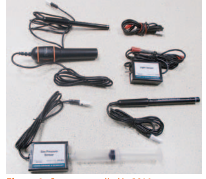
Figure 1 - Sensors supplied in 2016.

Colorimetry is a valuable analytical technique in many areas of biology and chemistry particularly for students in the senior phase.