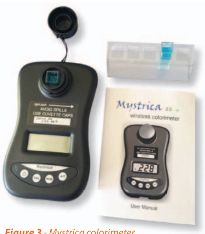
Figure 3 - Mystrica colorimeter.