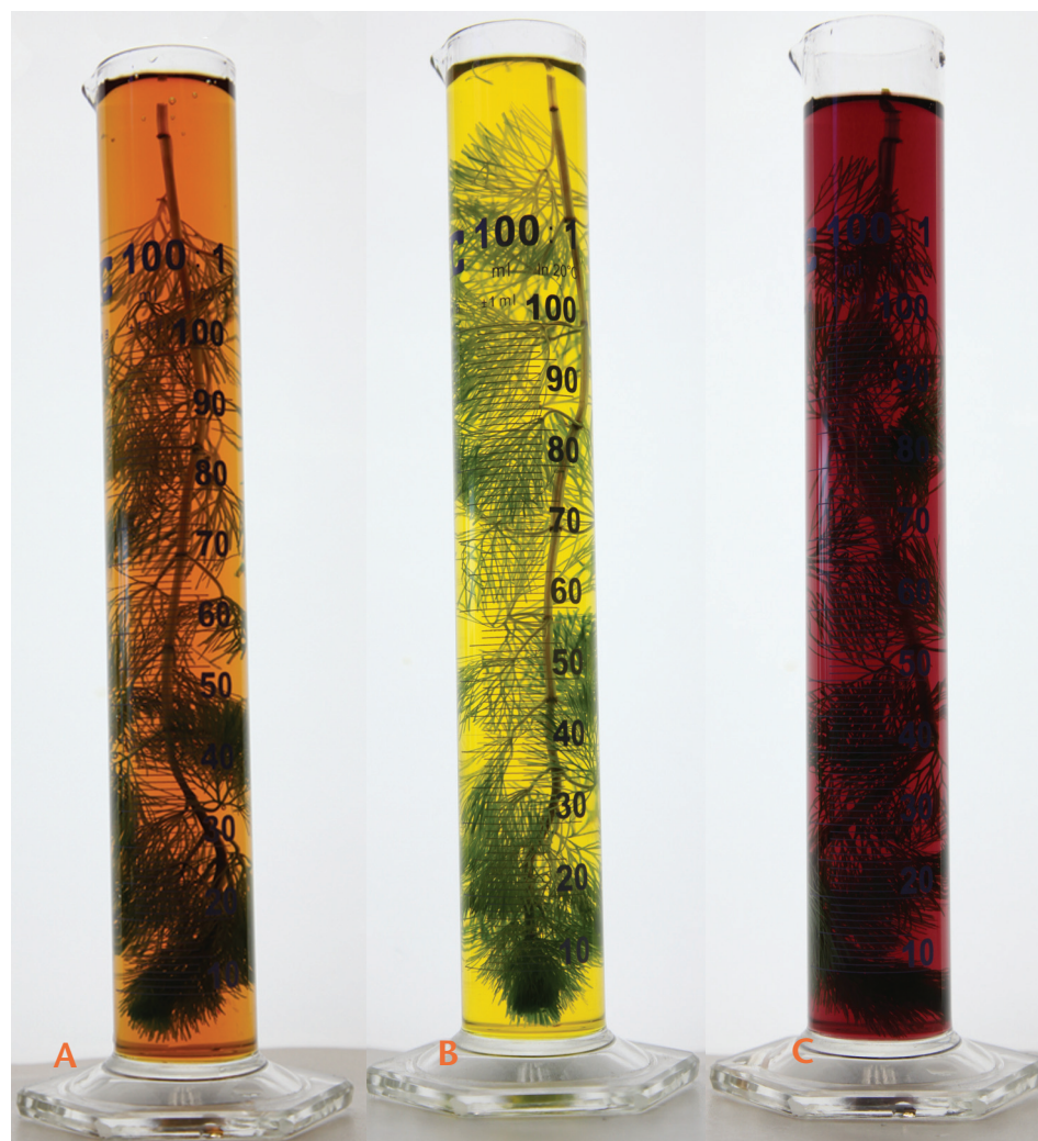
Figure 2 – Effect of irradiation on Cabomba / hydrogencarbonate indicator mixtures. (A) Prior to irradiation (pH measured to be 7.4) (B) After 4 hours irradiation during which the cylinder was covered in black paper (pH measured to be 7.0); (C) After 4 hours irradiation (pH measured to be 8.3)