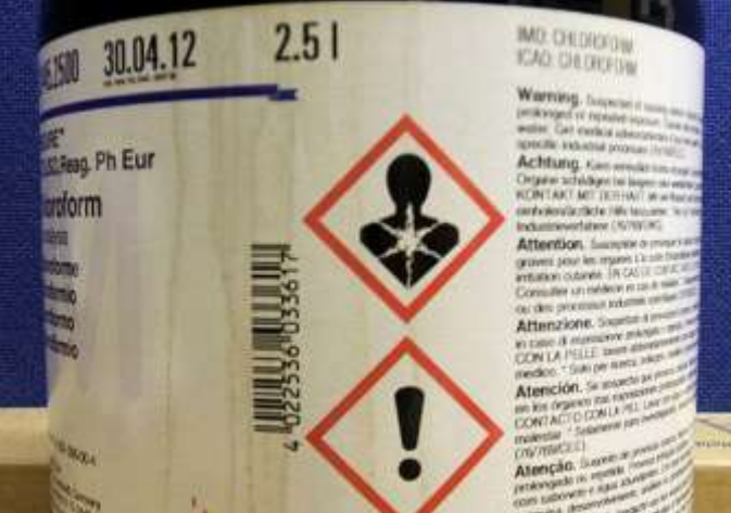
Figure 1 – A label on an existing bottle may look like this