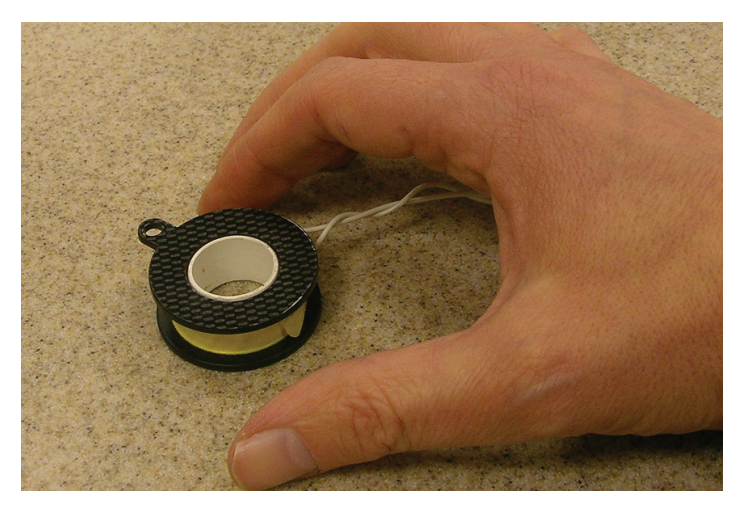
Figure 8 - SEP coil.

Taken as a group, we feel that these experiments could form the core of an Advanced Higher investigation. They go beyond the current curriculum but do not require exotic resources. The experiments work well and provide opportunities for data analysis and discussion.