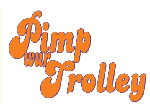
Figure 2 – A regional slant on trolley pimping

[5] Email: gregor@sserc.org.uk, Telephone 01383 626070