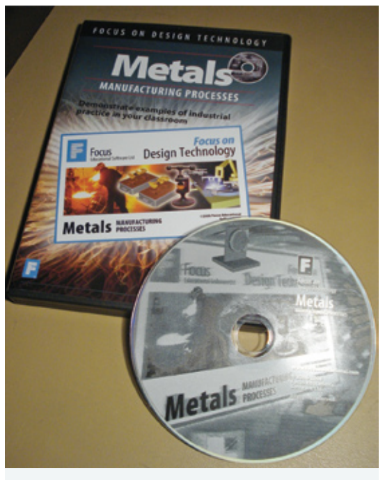
Figure 1 - Focus on Metals - Manufacturing processes

Metals – manufacturing processes provides a cost-effective teaching aid. It also allows, in particular, S3-S6 pupils to investigate and research current industrial practice. Multiplechoice questions enable direct testing of pupils on Product Design courses. Animations provide excellent step-by-step sequences to be demonstrated and controlled by the user.