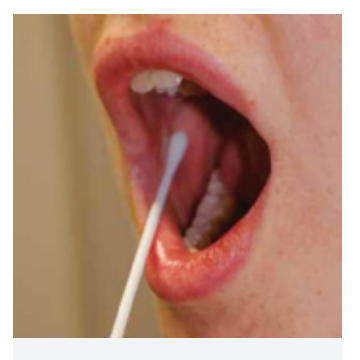
Figure 1 - Sampling cheek cells

Our answer to this is a resounding 'Yes'! What could be more fascinating than looking at your own body cells or extracting your own DNA? In our experience, such practical work both stimulates and engages pupils and has significant educational value. In carrying out this practical work, pupils do have to observe certain preventative and protective measures and the consideration of these, in itself, can have signifi-