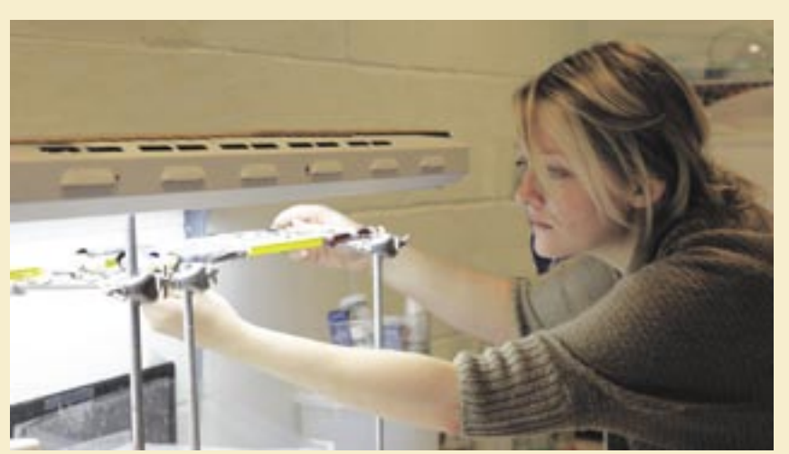
Figure 1 - Delegates at a recent Biology SSERC CPD event carrying out steps 6 and 7!