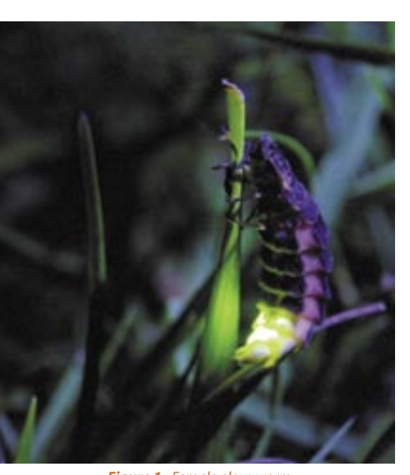
Figure 1 - Female glow-worm (Lampyris noctiluca). [9].