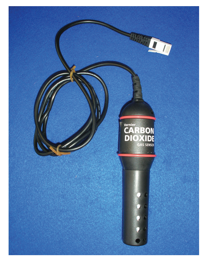
Figure 1 - CO<sub>2</sub> gas sensor (Product code VR105512) from Instruments Direct Services Ltd.

The basic structure of the sensor is shown schematically in Figure 3. Infra-red radiation is produced from a light emitting diode at one end of the sensor and is detected at the opposite end. CO_2 absorbs infra-red radiation and so at increased CO_2 concentrations less radiation will be detected. CO_2 moves in and out of the sensor by diffusion through one of the vent holes. The sensor is calibrated assuming an atmospheric CO_2 concentration of 380 ppm. Care should be taken if a re-calibration is deemed necessary since it is advisable to use 'fresh' air from outside rather than using air from a laboratory which will probably have a higher CO_2 level.