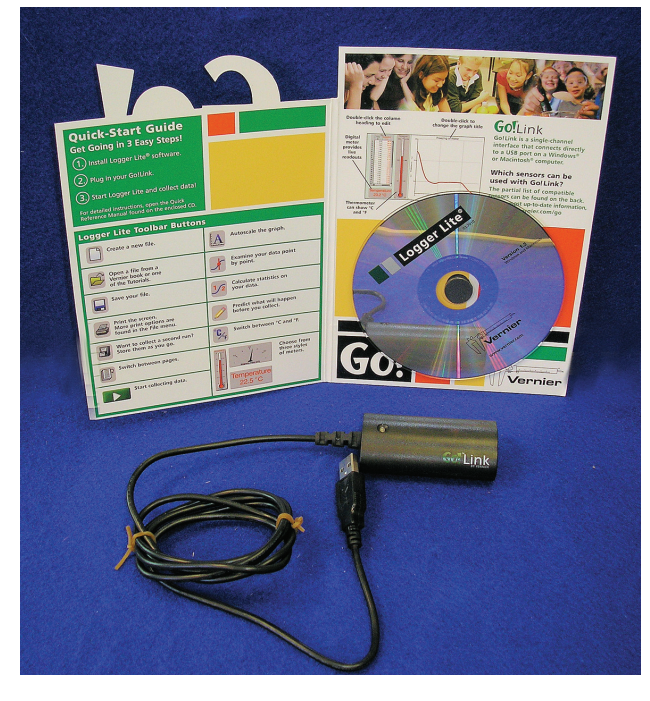
Figure 2 - Go!™ Link interface and Logger Lite Software