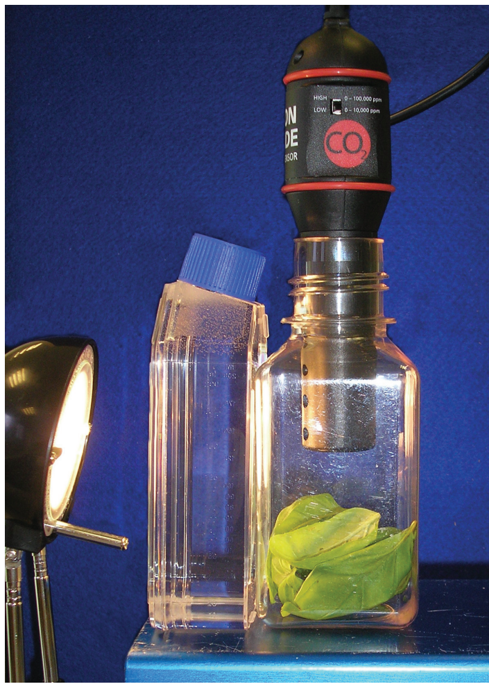
Figure 4 - Experimental set-up for measuring respiration and photosynthesis rates in plants.